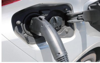
Electric Vehicle Charging Solution