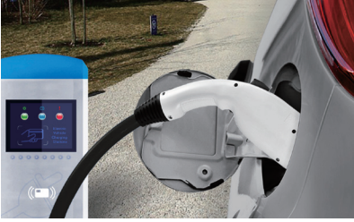
Public Charging Unit Application